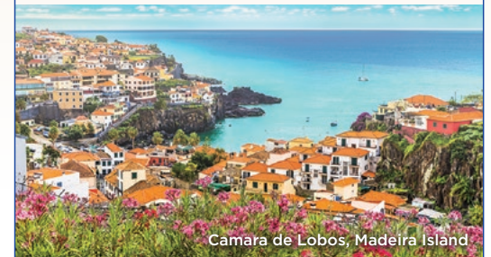
Camara de Lobos, Madeira Island